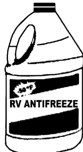
In 6/1 gal. case #44-6RV